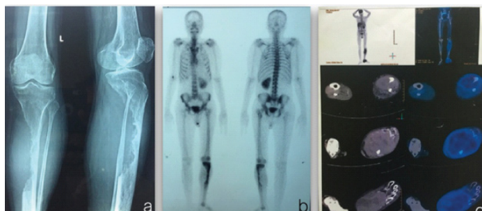
[Table/Fig-1]: (a) X-ray antero-posterior/lateral view of the knee showing cortical destruction of the proximal tibia and thinning of the fibula; (b,c) PET-CT showing activity in both the proximal and distal end of the tibia with minimal activity in the renal bed (suggestive of post-operative changes).

RCC has a high mortality rate, with a five year survival rate of <10%. The bone remains one of the most common distant metastatic sites of RCC either synchronous or metachronous presentation. The mechanism of tumour growth in bone is complex and involve tumour driven stimulation of osteoclast, osteoblast and other components of the bone, leading to significant patient morbidity due to the associated Skeletal Related Events (SREs). SREs are defined as pathological fractures, bone pain, impending fracture, spinal cord and nerve root compressions and hypercalcemia. SREs may significantly decrease patient quality of life [4].